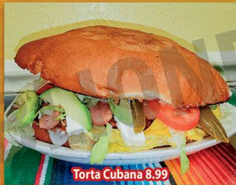
Torta Cubana 8.99