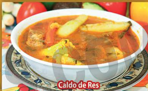
Caldo de Res