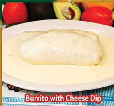
Burrito with Cheese Dip