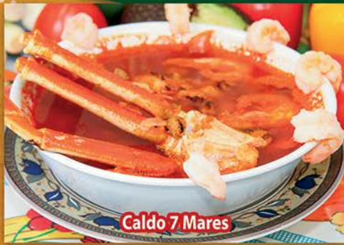
Caldo 7 Mares