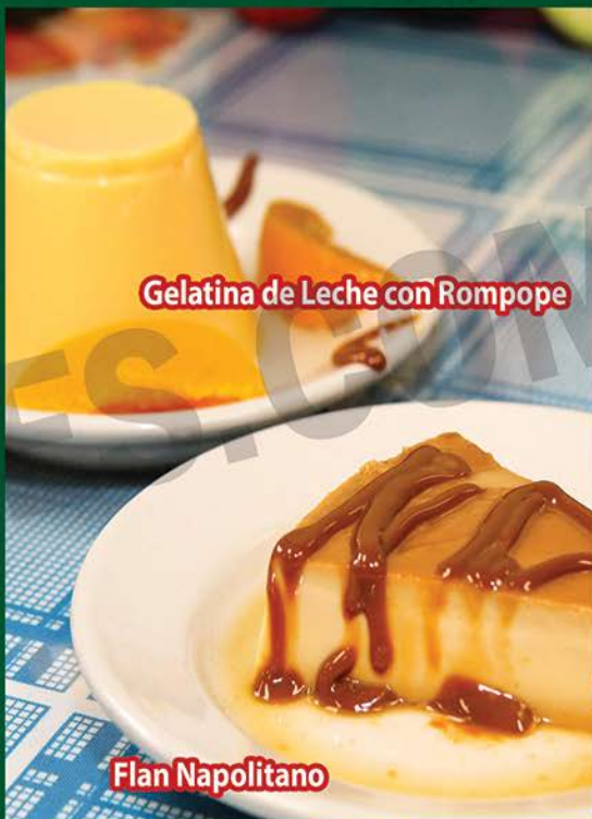
Gelatina de Leche con Rompopo