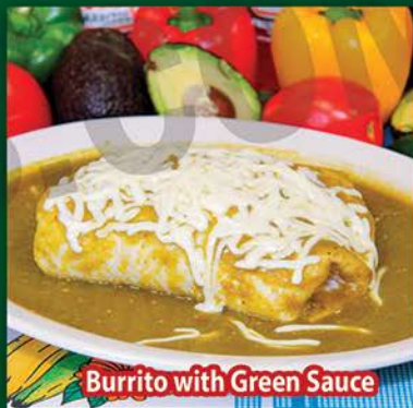
Burrito with Green Sauce