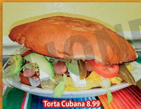
Torta Cubana 8.99