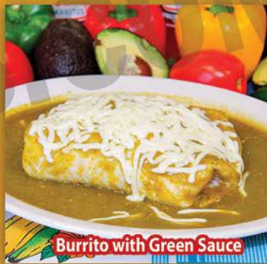
Burrito with Green Sauce