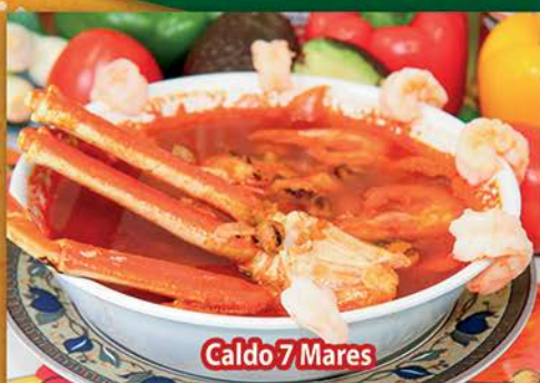
Caldo 7 Mares