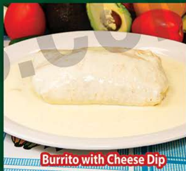
Burrito with Cheese Dip